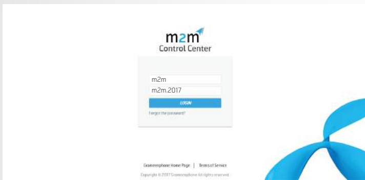
Figure-1: Login Page of M2M Control Center

Grameenphone's M2M Control Centre service is a sophisticated cloud-based platform that gives you the complete visibility over your GP-enabled M2M connections.