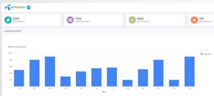
Figure-2: Dashboard View

The M2M Control Centre has a range of features to simplify and automate your M2M solution. The platform offers a suite of self-service tools, such as device information, SIM status, usage control and many more, which can help you to drive efficiency, deploy faster and improve the profitability of business.