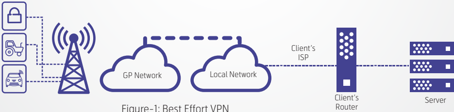
Figure-1: Best Effort VPN

Connect your private APN within the GP wireless network to your internet gateway router via an encrypted IPSEC tunnel. Connectivity is provided over your existing ISP links, which is connected to the National Internet Exchange (NIX). The QoS of the VPN tunnel depends on the standard SLA offered by NIX and your ISP.